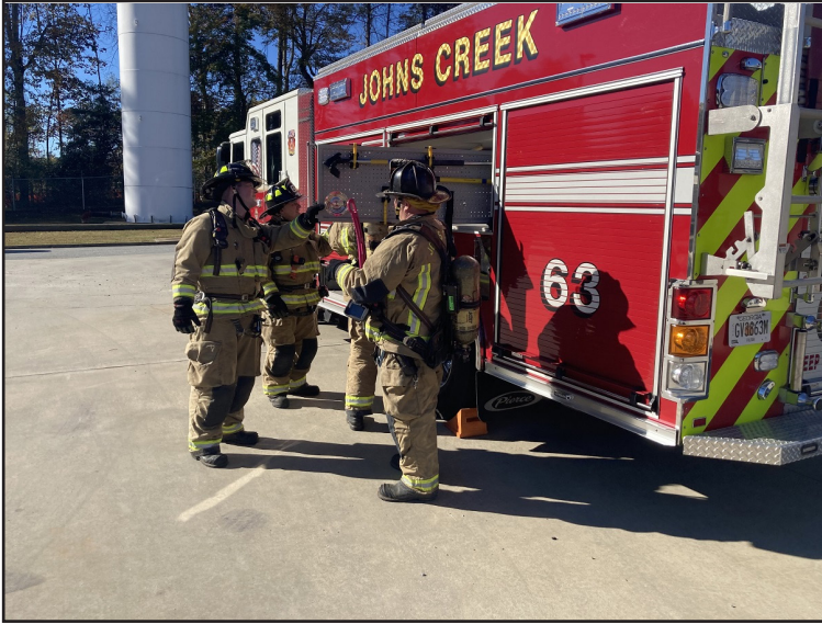
Johns Creek firefighters pull tools off their fire engine to begin training.

Firefighters with Johns Creek Fire Department, located in Fulton County, trained at the Cherokee County Fire Training Center back in November.