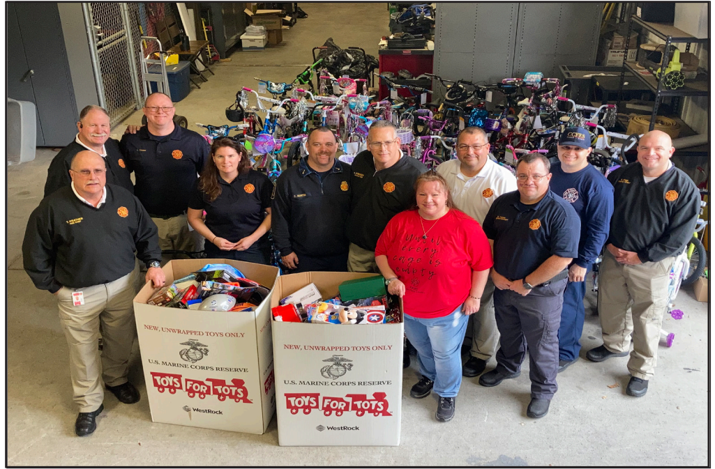
Employees with Cherokee County Fire and Emergency Services stand in front of 80+ bicycles that were collected this year.