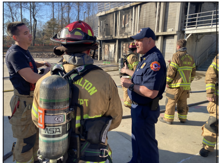
Firefighters from the City of Milton get final instructions prior to their training.

We are blessed in Cherokee County to have this wonderful training facility and allowing other firefighters to come here and train is like brothers helping brothers.