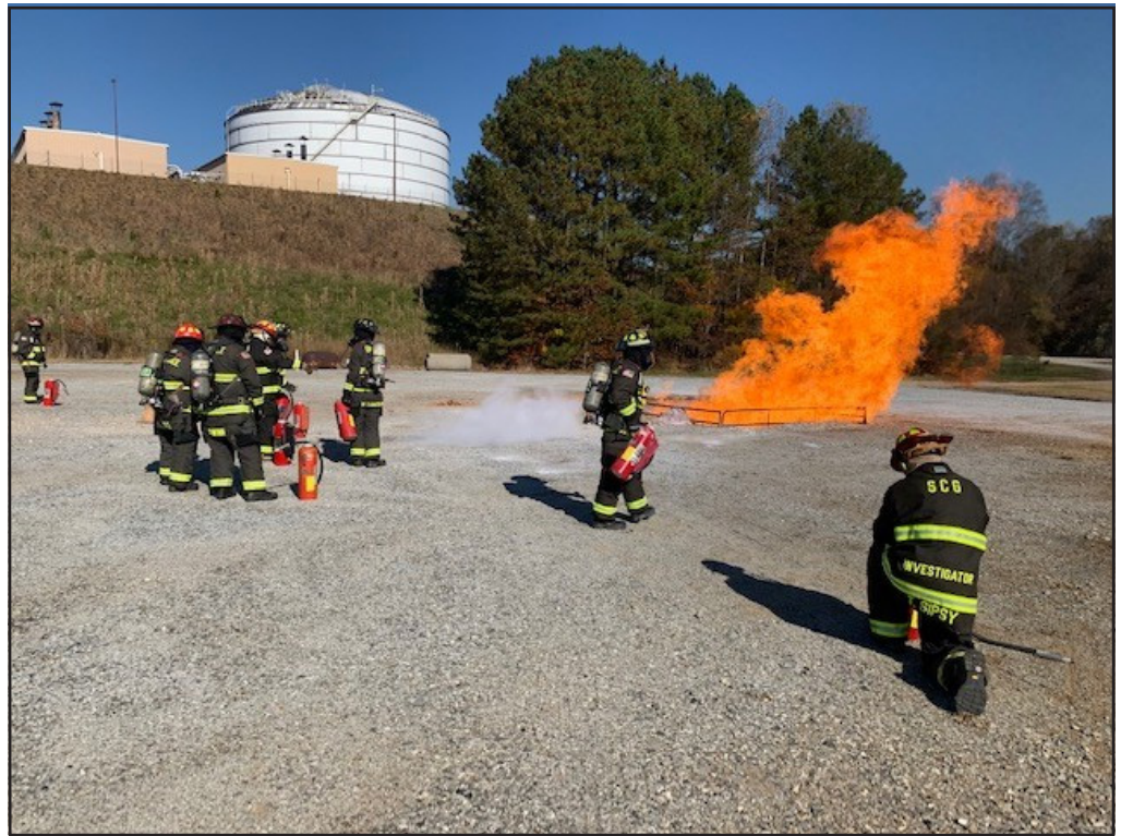
Cherokee County firefighters participate in a fire control class at the LNG Plant in Ball Ground.

Specials Operations Chief, Darrell Mitchell, stated that the fire department tries to do a training event at the plant every year. The 8-hour training course includes a tour of the facility and approximately 3 ½ hours of classroom training which shows the process of how natural gas is made. Plus, at the end of the day, the firefighters go to a fire training pit where liquid natural gas is put in a hole and set on fire. The firefighter put the fire out using fire extinguishers which is the tool of choice for handling and putting out these types of fires.