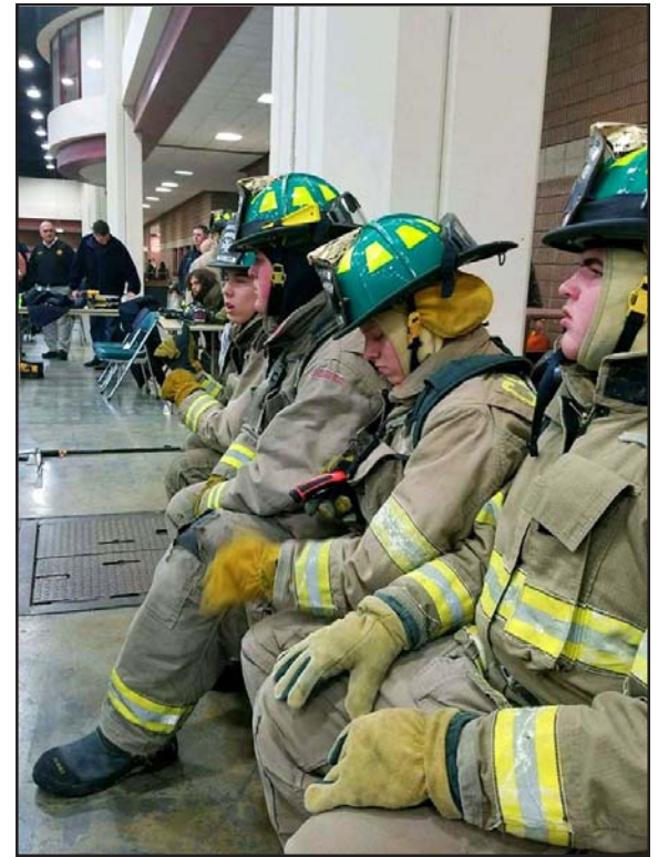
Cherokee County Fire Explorers wait patiently for their next event.